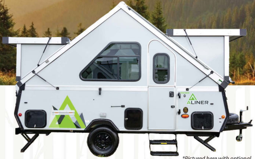
*Pictured here with optional front and rear dormers.

Ready to handle any adventure , the Expedition Series offers nearly double the “living space”, 30% more storage room, taller counter tops, larger beds, flush mount euro style sink and stove, and our highest capacity chassis compared to our other models. Even as our largest model, it weighs less than 2,300 lbs and is towable by many fuel-efficient vehicles. The Expedition is a perfect model for the whole family or the couple that just wants more room.